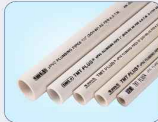
uPVC Plumbing Pipes