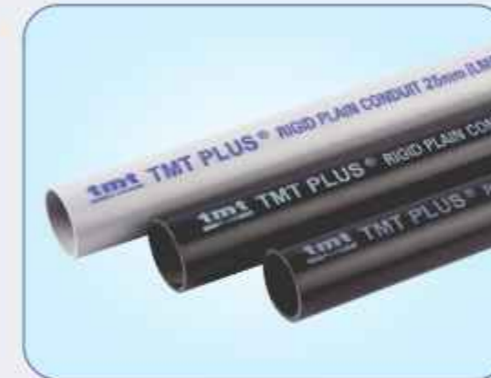
uPVC FRLS Conduit Pipes