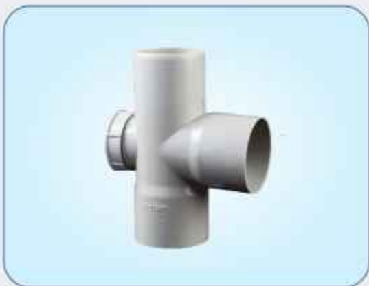
uPVC SWR Fittings