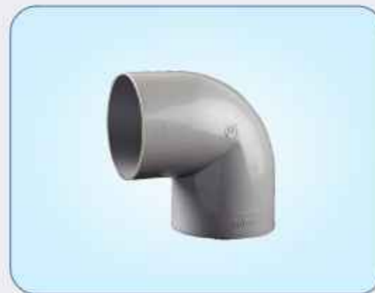
uPVC Agri Fittings