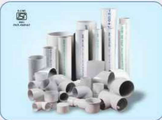
uPVC Agriculture Pipes & Fittings