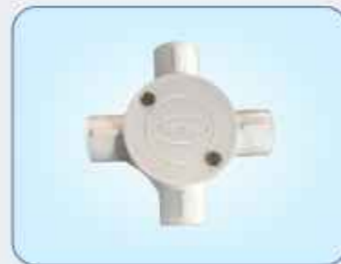
Pvc Junction Box