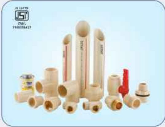
cPVC Pipes & Fittings