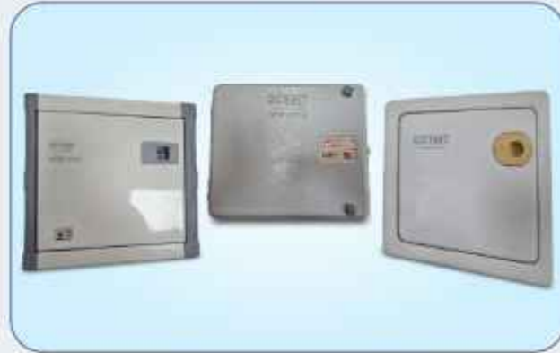
MCB Box & Changeover