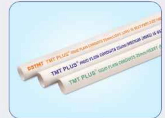
uPVC FR Conduit Pipes