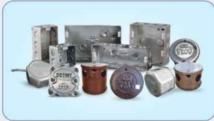
Metal Boxes & Accessories